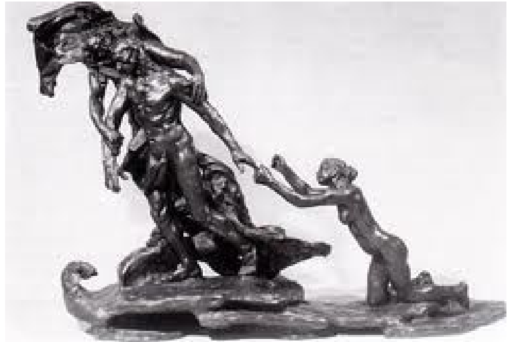
The Angel gathering a believer upon their death

The penalty for sin had yet to be paid. Mankind was essentially still legally in their sins. Although Jewish required the sacrifice of animals as a sin offering for the forgiveness of sin, it was a temporary fix Throughout the year, practicing Israelites had to sacrifice animals as a sin covering.